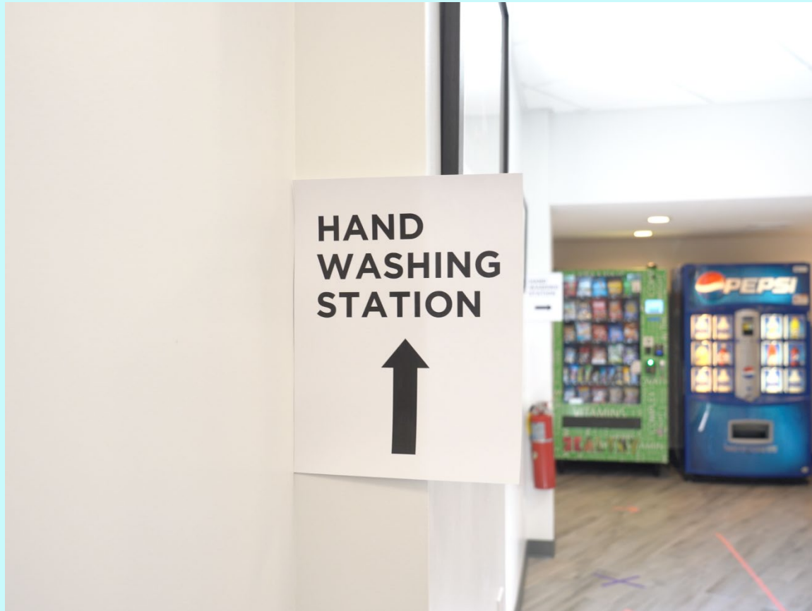
Hand washing at our sink